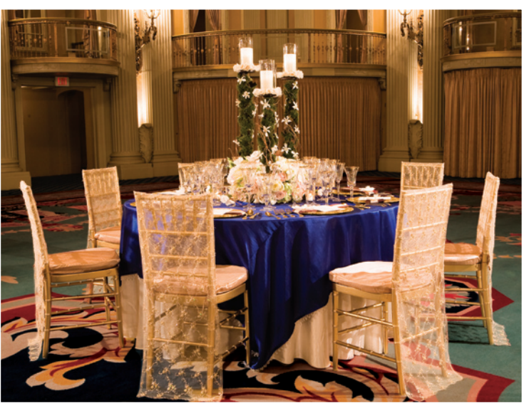
BOTTOM CENTERPIECE A low base of ivory and creme roses, lisianthus, cymbidium orchids and hydrangea ground a group of four tall, mossy pillars entwined with curly willow and stephanotis.