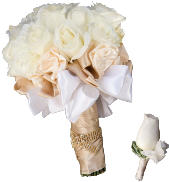
BOUQUET & BOUTONNIERE An elegant mix of white roses, dahlias, sweet peas and cattleya orchids are wrapped with a champagne satin ribbon and finished off with a gold diamond belt. For the boutonniere, a creme rose is accented by the mouth of a cattleya orchid and baby succulent leaves.