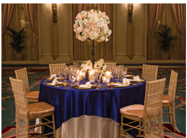
TOP CENTERPIECE An elegant crystal candelabrum filled with ivory and creme roses, hydrangea, dahlias and lisianthus helps to set the mood for a romantic ballroom reception.