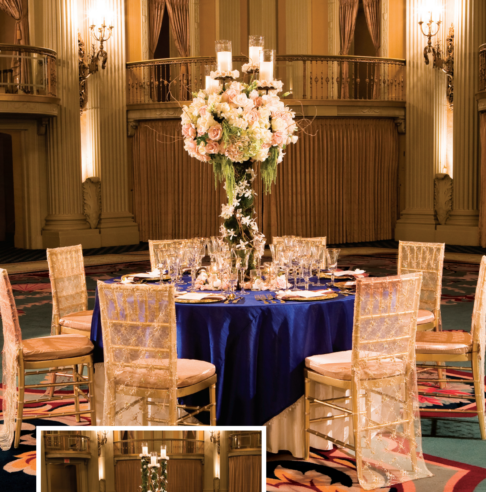
TOP CENTERPIECE A moss-covered container is decorated with flowing blooms, including white dendrobium orchids, shades of white and ivory roses, lisianthus, cymbidium orchids, hydrangea, hanging amaranthus and curly willow.