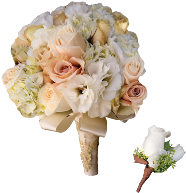
BOUQUET & BOUTONNIERE Roses, hydrangea and lisianthus in shades of ivory are luxuriously tied in a silky champagne lace wrap. The rose and lisianthus boutonniere coordinates with the bouquet.