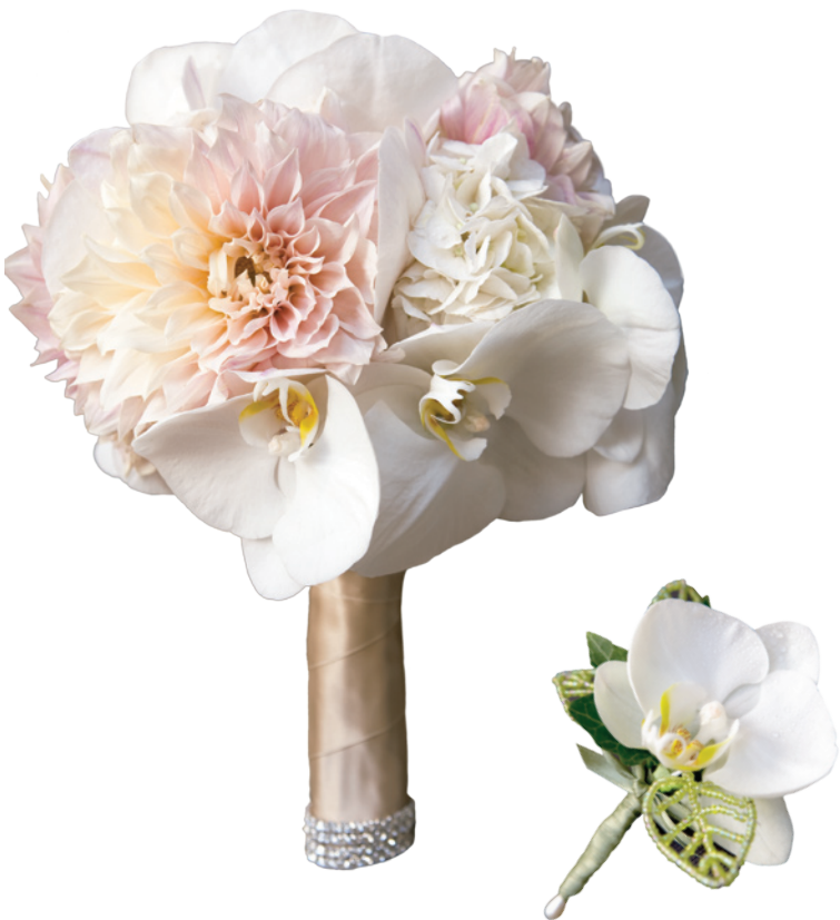
BOUQUET & BOUTONNIERE White dahlias, phalaenopsis orchids, dendrobium orchids, hydrangea and miniature cymbidium orchids create a lush bouquet. The boutonniere features a white phalaenopsis orchid accented by a green leaf.